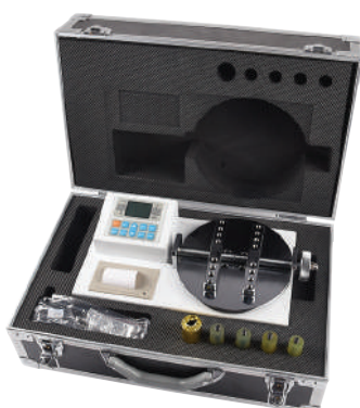
ENL-P/WP series with package