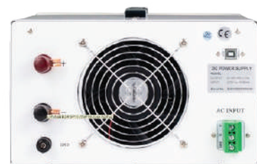
TP-P Series (L & XL chassis)