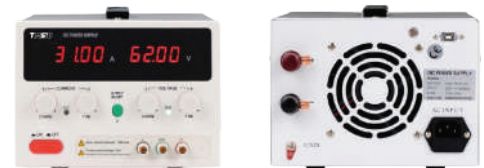
TP-P Series (M chassis)